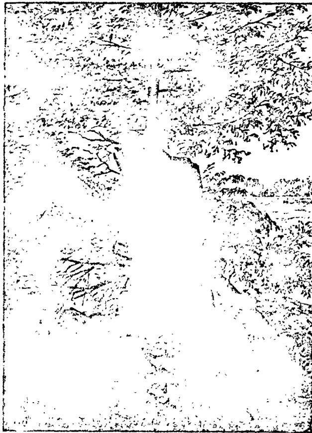
This etching is from an actual photograph taken on the bank of a Canadian lake. It shows a dead cedar stump, and a young tree growing out of the roots that have reached down near the water's edge. It illustrates the articles foregoing.

25 Jehovah uses the things of the creation of earth to teach important lessons to those who have an honest desire to learn the truth. Now he makes known that pride and the love of self-gain led Lucifer to rebellion and to his destruction. As we observe the new cedar tree raised up by Jehovah in the place of that one that goes into complete destruction let us give thanks unto Jehovah God that he has made provision for the re-establishing of an organization that will be true and faithful to him for